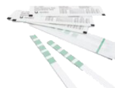
18-ME05-01 ถึง 18-ME05-02