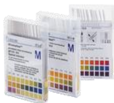
18-ME02-03 ~ 07