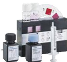
18-ME09-01 ~ 02