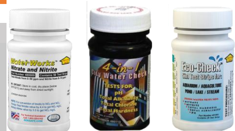
18-SS03-01 18-SS04-01 18-SS04-02

18-SS01-01 Free chlorine water check / Sensafe / 0 – 6 ppm 18-SS01-02 Free chlorine water check / Sensafe / 0 – 25 ppm 18-SS01-03 Free chlorine water check / Sensafe / 0 – 750 ppm 18-SS01-04 Free chlorine water check / Sensafe / 0 – 120 ppm 18-SS02-01 Total hardness / Sensafe / 0 – 1000 ppm 18-SS02-02 Total chlorine / Sensafe / 0 – 10 ppm