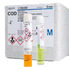
18-ME13-01 ~ 05