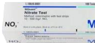
18-ME17-01 ~ 03