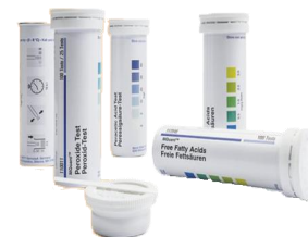
18-ME01-01 ~ 03