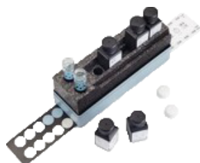
18-ME08-01 ~ 04